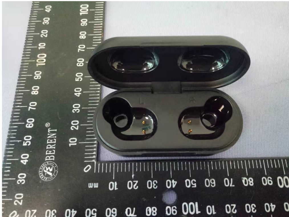
Figure 3 Overall view III of Charge Case (充电盒III)