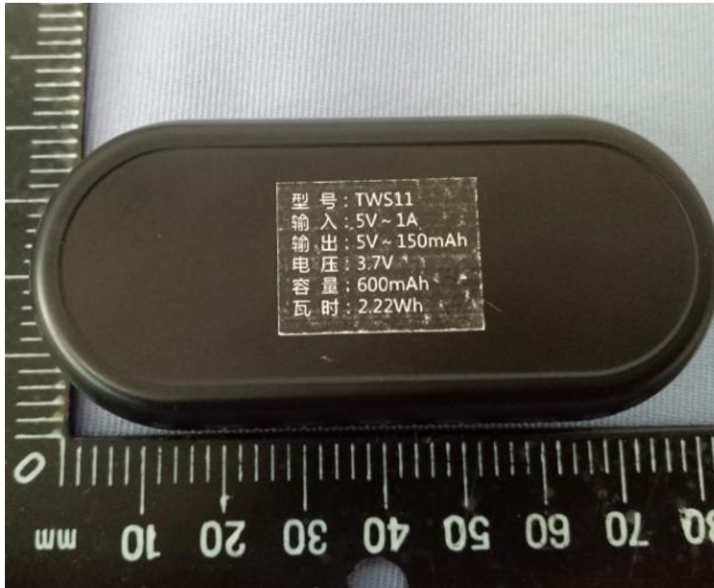
Figure 5 Battery label