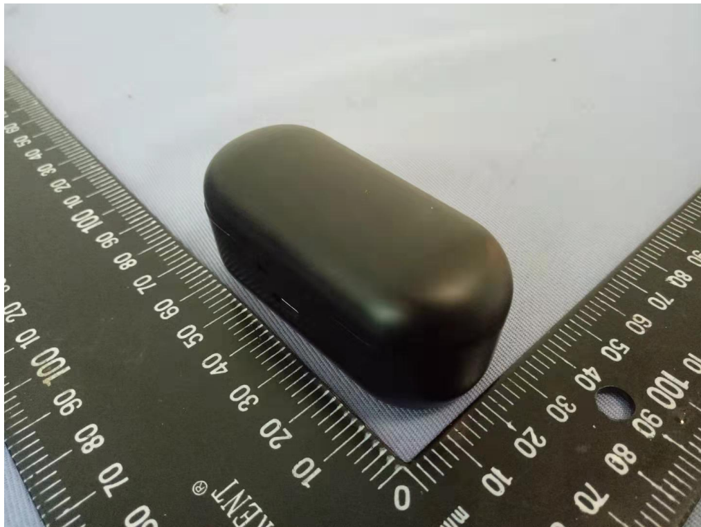
Figure 2 Overall view II of Charge Case (充电盒II)