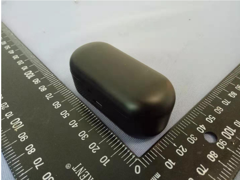
Figure 1 Overall view I of Charge Case (电池图)