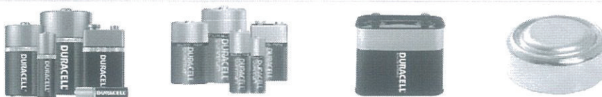
Major Cells Major Cells Lantern Specialty